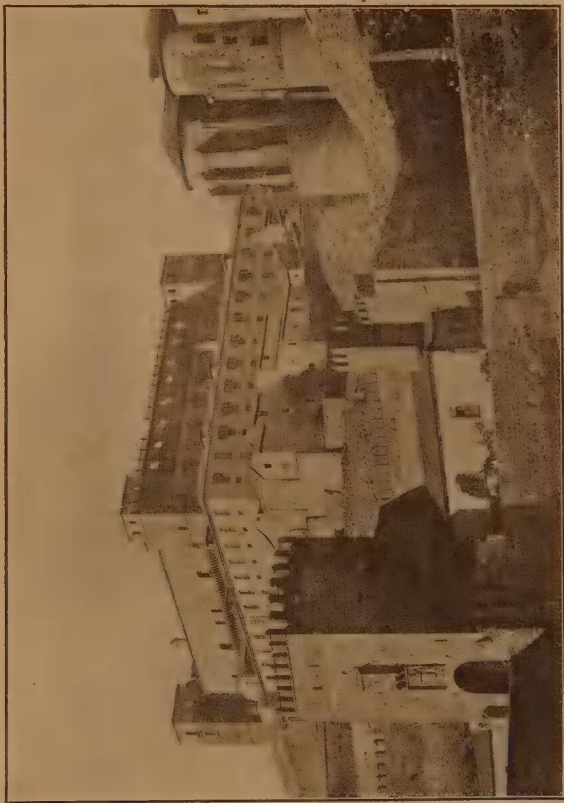
PALACE OF CARLOS V., TOLEDO